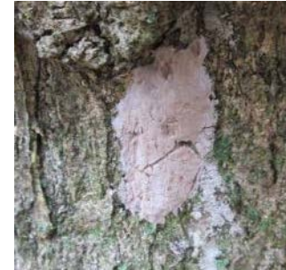
Eggs: October - June