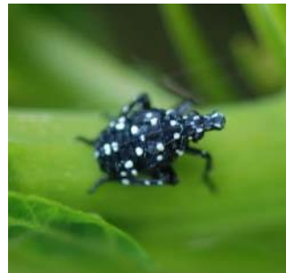
Third Instar: June - July Second Instar: June - July