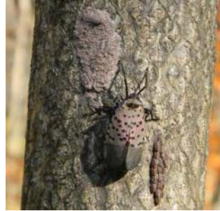
Egg Laying: September - November