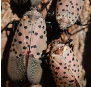
Adults: July - December