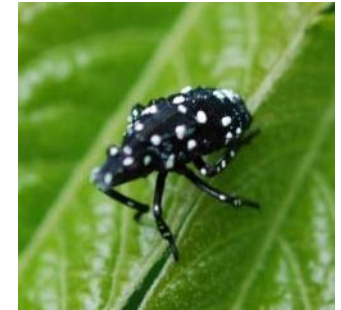
Hatch and 1st Instar: May - June