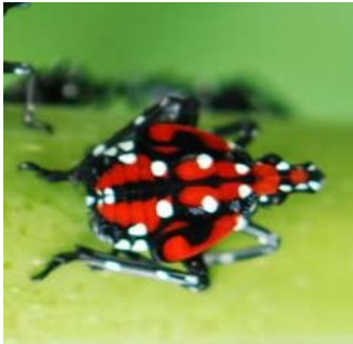
Fourth Instar: July - September